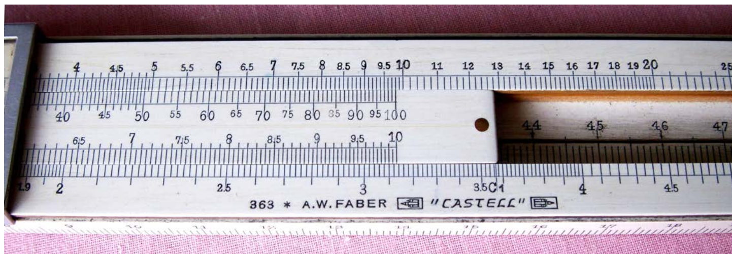
Figure 1. A typical Faber-Castell logo. Note also the centimetre scale in the well, and the peg at the end of the slide to help fix the celluloid in place.

The Faber company was, and still is, based in the state of Bavaria in southern Germany. Most of the rules from our period in my collection were made for the British market and are marked "MADE IN BAVARIA.", following the logo and in the same style of lettering but of a smaller size (from about 1912, MADE IN BAVARIA appears some distance away from the logo). However, I have three rules made for the German market which bear no country of origin markings. Also I have or have seen several rules that were probably made for the US market that are marked "MADE IN GERMANY." This is the case in for example the illustrations in [2]. Thus I believe the statement sometimes seen that MADE IN GERMANY appeared until about 1900 when it was replaced with MADE IN BAVARIA is an over-simplification. I suggest that the three varieties I have seen (no country of origin, MADE IN