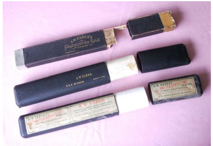
Figure 5. Old-style (top), and new-style (bottom) boxes. Top and bottom faces are shown for the new box. Note the DRP 206428 announcement.

digit-registering cursor. This information tallies with Clay Castleberry's article [7].