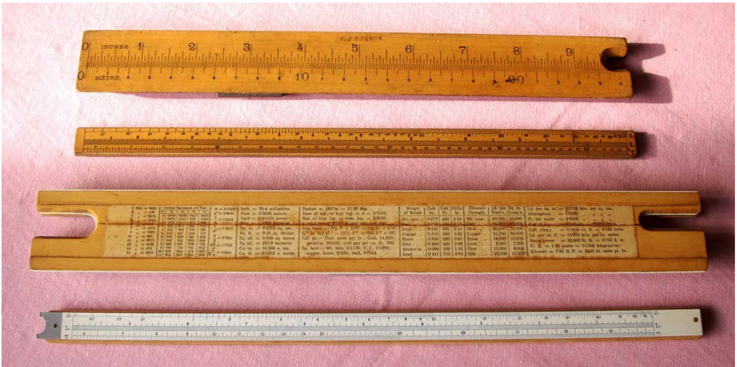
Figure 4. The reverse sides of the models shown in Figure 2.

Reference [2] also stresses that the information on the celluloid facings (but not on the all-wooden rules) is “now SCORED or INCISED” into the surface. The word “now” suggests that this is a new feature, so that earlier rules with celluloid facings are not “scored or incised”, i.e. the information is simply printed on the surface as is the case with the rules without celluloid facings. [2] also mentions that the information scored into the celluloid is marked in blue, but I am not yet aware of any rules so marked: black is the normal colour.